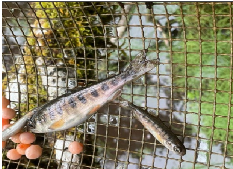
Figure 1.–Juvenile coho salmon caught at waypoint 674.