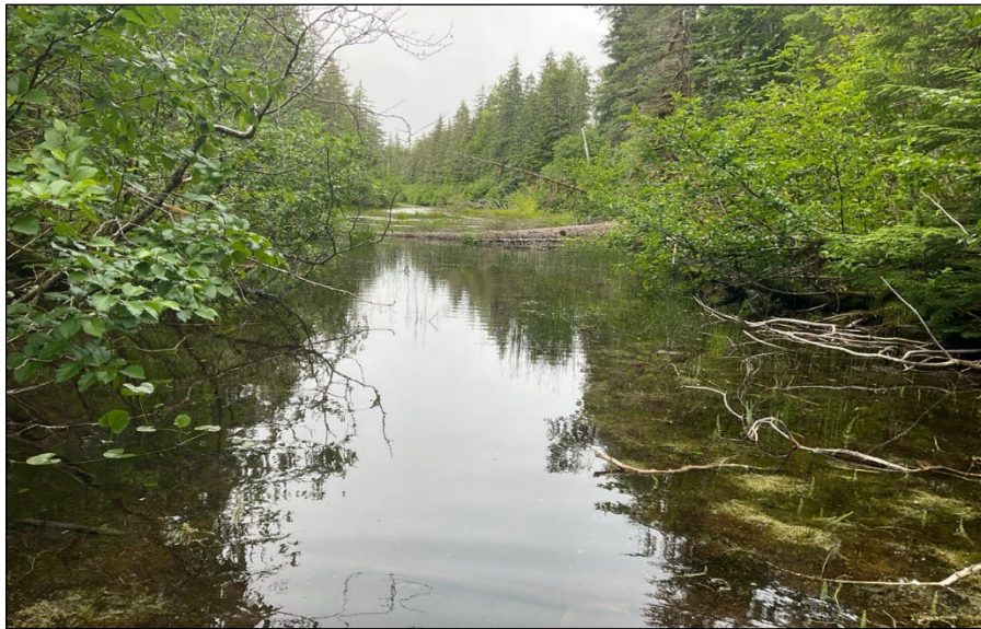
Figure 3.—Ponded water, looking downstream at waypoint 674.