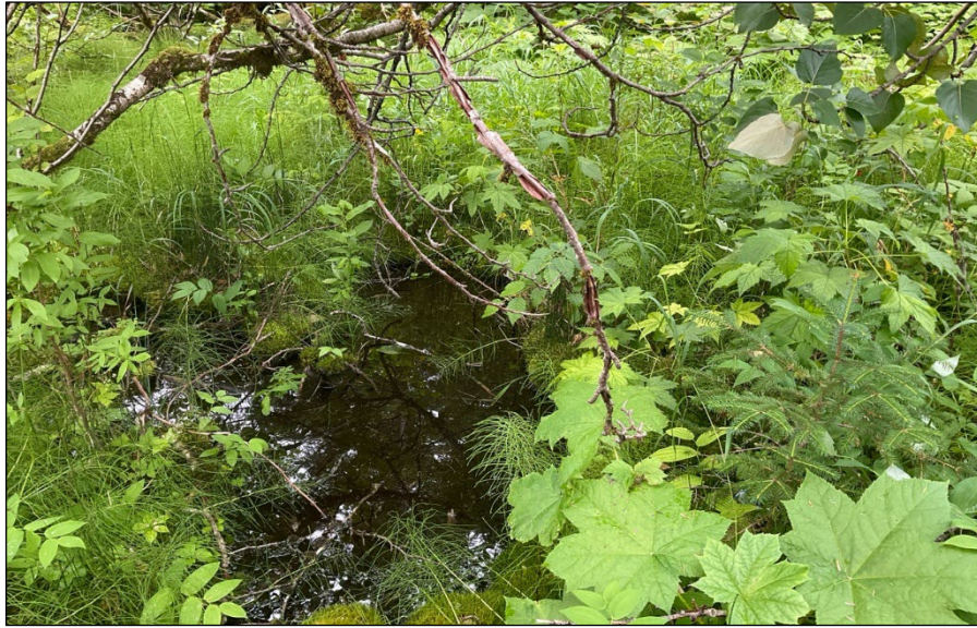
Figure 2.—Water seeping out of the ground at waypoint 675.